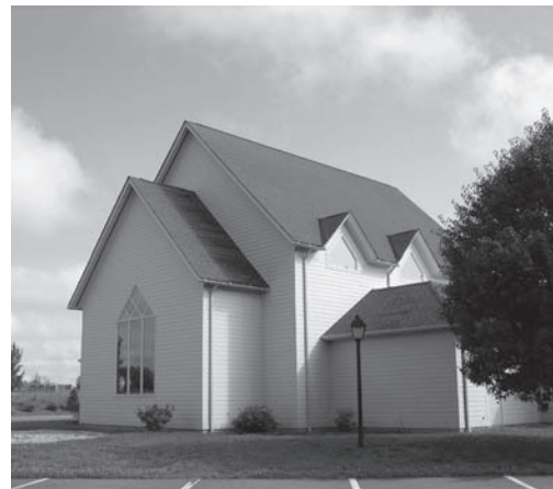
Wright's Chapel, 2012