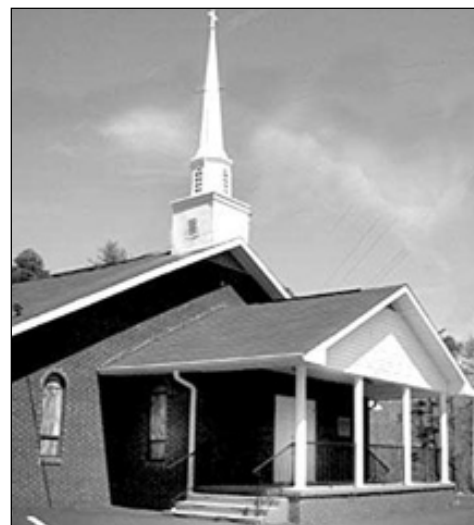
Ebenezer Baptist Church at Present

The first pastor, Rev. E.R. Treadway, was elected in May 1898. The first foreign missionary work recorded was in 1899 when a collection of $1.79 was taken to send to Cuba. In September 1907 land was purchased to build a church. In 1910 it was reported that there were 83 members which belonged to Ebenezer Baptist Church. In 1927 the church was moved from the top of the mountain to where it is located now.